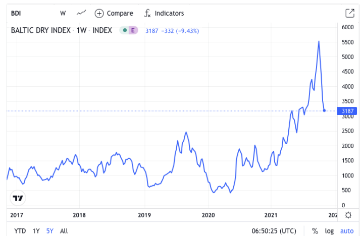
Figure 1: Baltic Dry Index. Reference https://tradingeconomics.com

The Business Development team is focussing on the next stages of the multi-stage development strategy, including a Stage 2 expansion of the concentrate business followed by a Stage 3 development to convert the concentrate material into HPMS for electric vehicle EV batteries to power the global transition away from fossil fuel powered mobility.