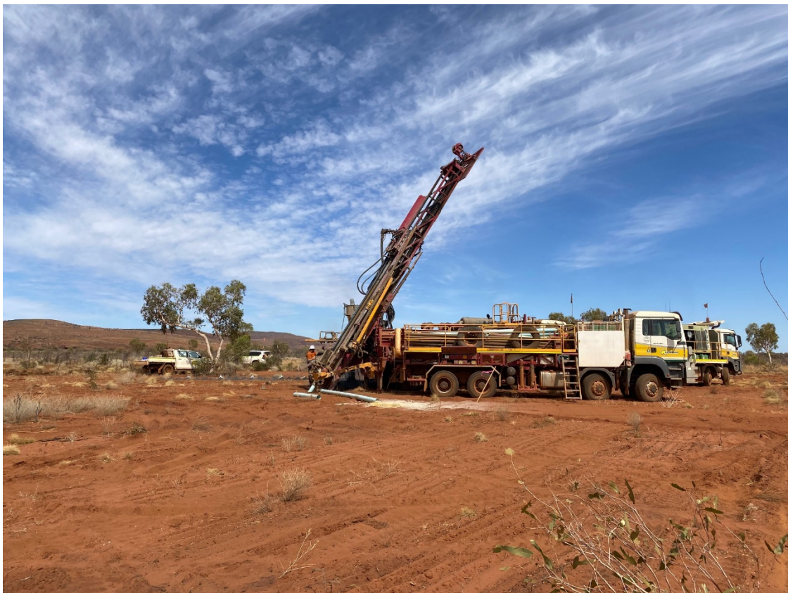
Image 1: Maiden RC drilling at the Blue Rock Valley Copper Project (Target 1).

Target 2 comprises of three overlapping EM anomalies at the historic Blue Rock copper shafts which recently returned an impressive 49.9% Cu rock-chip sample (refer to ASX announcement 13 th October 2021).