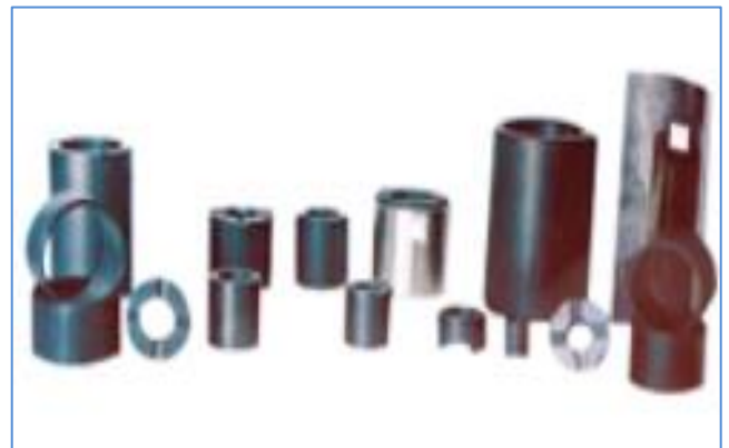
High Purified Graphite Products