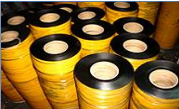
Flexible Graphite Tape