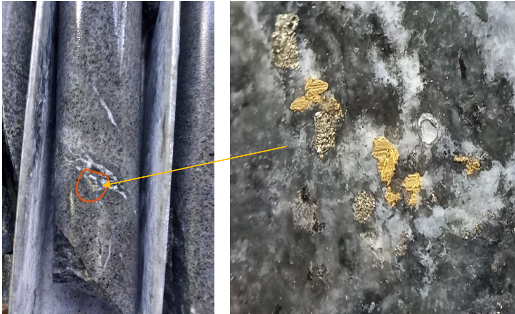
Figure 3: Photo of a portion of uncut drill core from TUDDH544W2, showing coarse visible gold and pyrite. This 30cm sample returned 112 g/t Au from 631.1-631.4m.