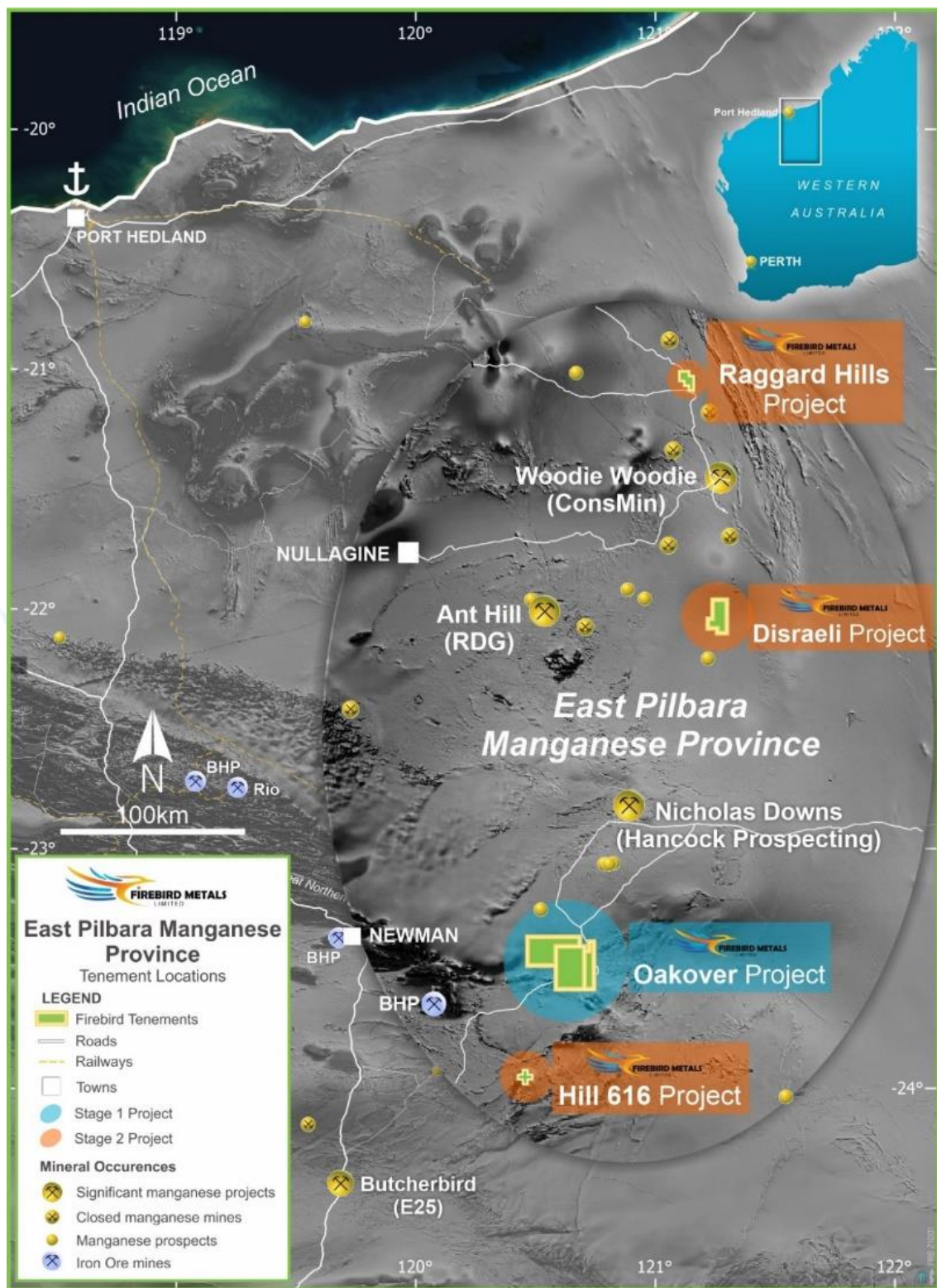
Figure 1: Firebird Project Map