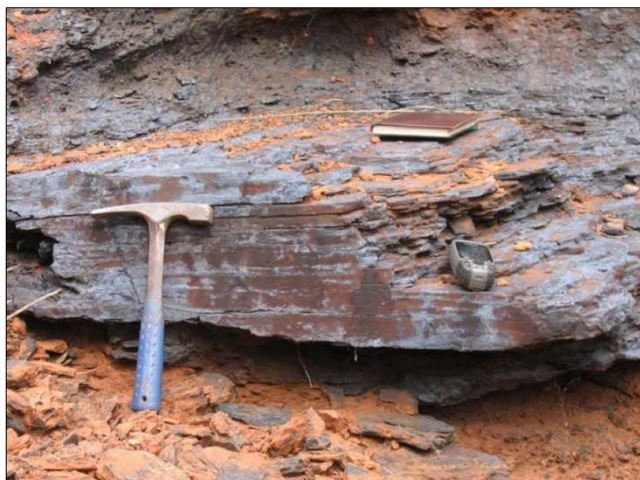
Image 1: Manganese Mineralisation at Hill 616

Hill 616 is an exciting development opportunity for Firebird and exhibits many of the geological characteristics of the Company's flagship Oakover Project, which contains an existing 64Mt Resource, with significant exploration and growth upside.