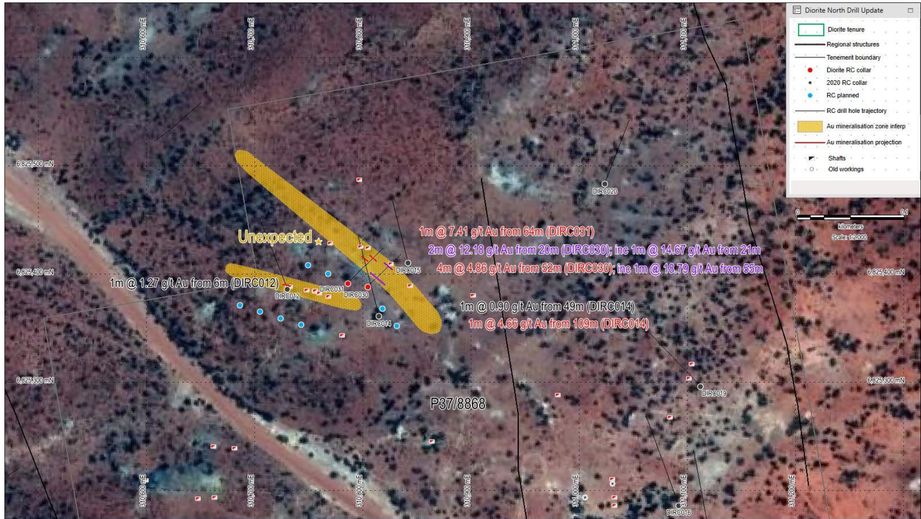
Figure 3: Diorite North Unexpected Drill Collars and significant intercepts