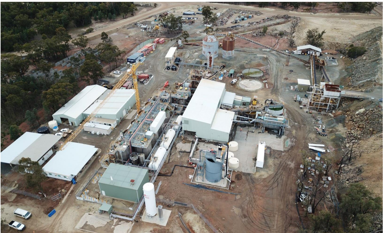
Figure 2. Site infrastructure includes a 350ktpa flotation and 400ktpa CIL circuit.

The Project hosts existing infrastructure, including an existing processing plant (Figure 2), access to grid power and public roads, which will help accelerate a restart to mining production delivering on Kingston's stated aims of becoming a gold producer.