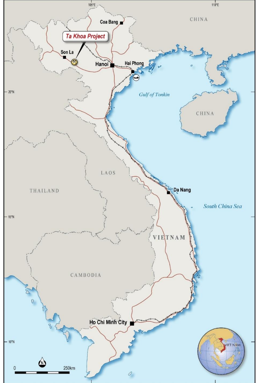
Figure 2. Ta Khoa Nickel-Cu-PGE Project Location

By combining the Company's existing mineral inventory (Ban Phuc Disseminated Sulfide - DSS), exploration potential presented by high priority targets such as Ban Chang, King Snake, Ta Cuong and Ban Khoa, and the ability to source third party concentrate, Blackstone will be able to increase the scale of its downstream business to cater to the rising demand for downstream nickel products.