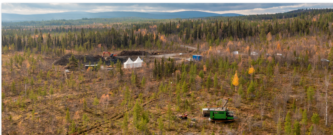
Figure 1 2021 Drilling at Talga's Vittangi Graphite Project in Norrbotten, Sweden.

The initial 56 diamond drillholes for 6,790 meters was completed across strategically important development and growth targets (see Table 1) of what is already Europe's largest and highest grade JORC graphite resource.