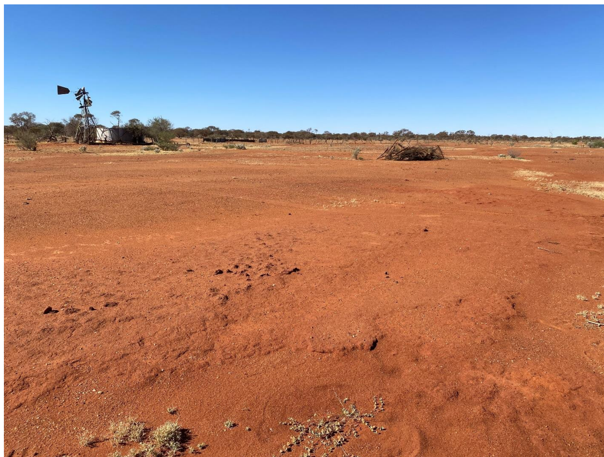
Figure 1 Photograph of the Jackarro Well, located in the Wheelo creek catchment, showing typical site conditions along the alluvial terraces.