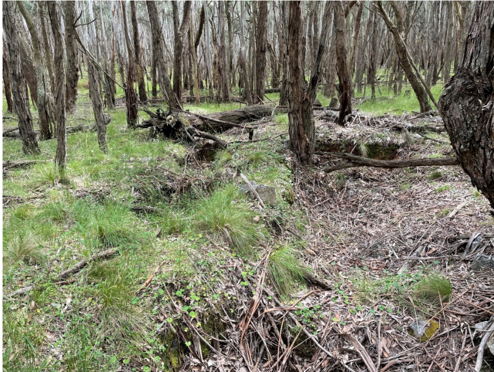
Figure 2 – Historical gold working at the Goldie Prospect