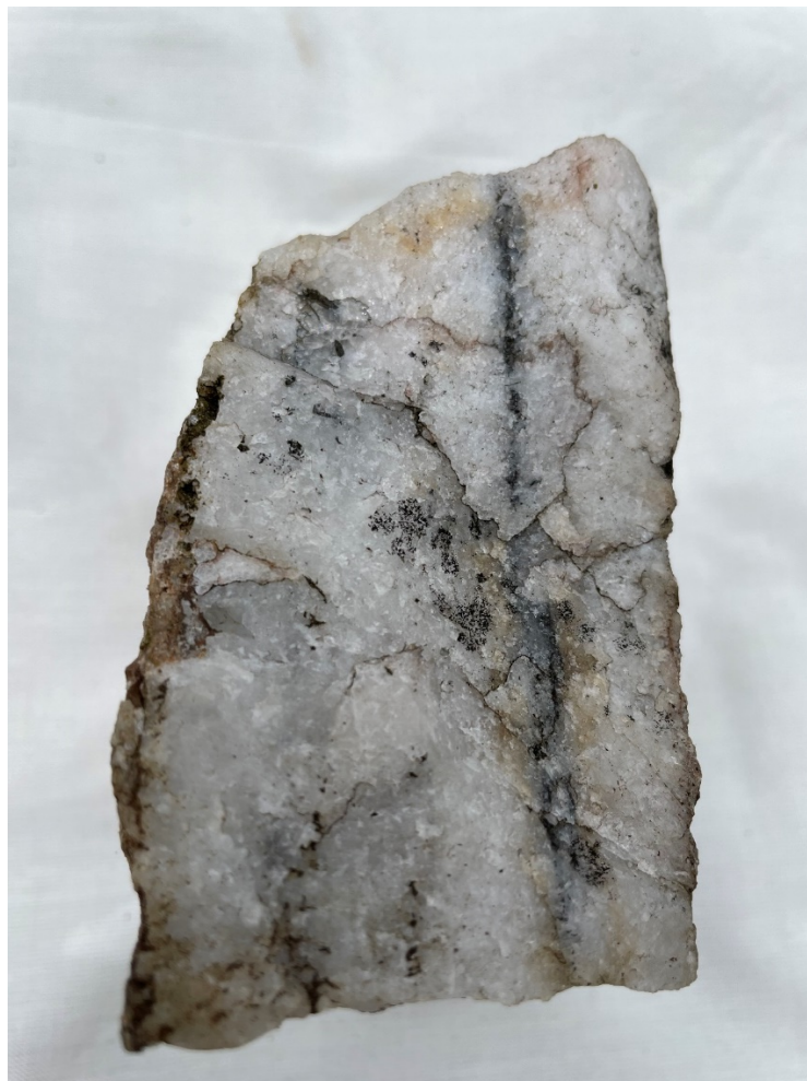
Figure 3 – Stockpiled quartz float sampled by Torrens at the Goldie Prospect