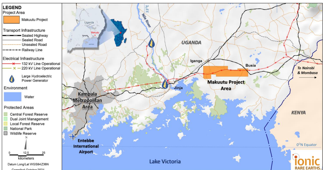
Figure 3: Makuutu Rare Earths Project Location with major existing infrastructure.

The Project has the potential of generating a high margin product with an operation life exceeding 27 years. The Project is also prospective for a low-cost Scandium co-product.