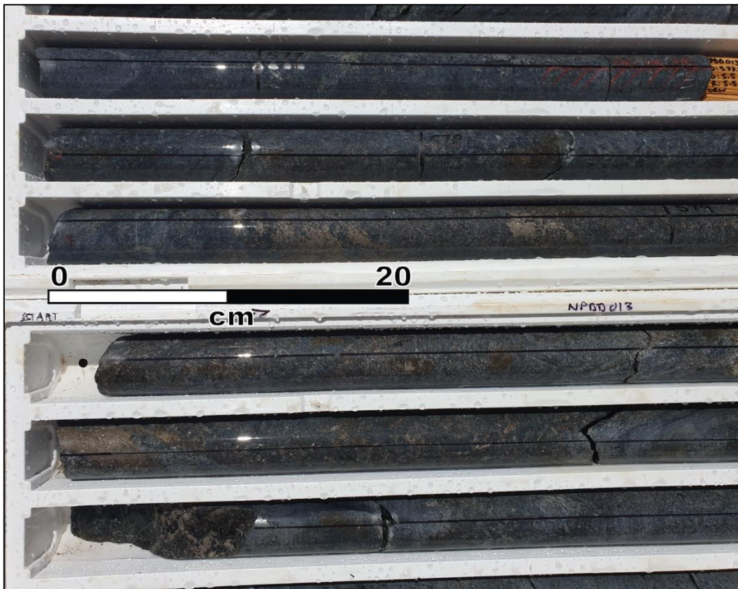
Photograph 1 – Intersection of NPDD013 from 576.8m to 581.5m showing matrix and heavy disseminated sulphides (Po-Pn-Cpy)

Regional exploration at Nepean currently comprises the ground dipole-dipole induced polarisation (IP) survey that recently commenced over the Nepean North Prospect of the Nepean Nickel Project (Figure 2), where a recent geochemistry review highlighted the prospectivity of the ultramafic sequences for nickel sulphide mineralisation. To date a total of five lines have been completed, with the survey commencing from the north. Preliminary results have identified some strong chargeability features in fresh-rock associated with both a gabbro/dolerite and the eastern basal contact of the Nepean ultramafic. The survey is expected to be completed in approximately 2 weeks, and finalised results will be used to plan follow-up exploration and drilling.