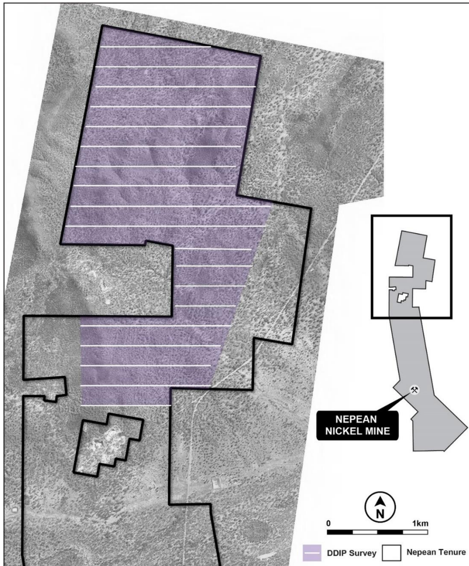
Figure 2 – Map showing location and survey lines of the ground IP survey underway in the north of the Nepean Project. To-date the northern five lines have been surveyed

This announcement has been authorised by the Board of Directors of the Company.