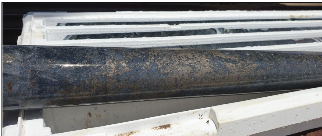
Photograph 2 – Intersection of NPDD013 at 578.4m showing matrix to semi-massive sulphides (Po- Pn-Cpy)