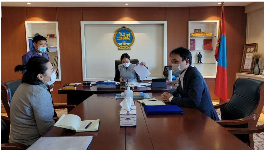
Telmen staff meeting with Gurvantes local government representatives

Talon Energy Ltd (Talon or the Company) is pleased to advise that Telmen Resource JSC ( Telmen ) has commenced the community consultation process which is the final stage of the Environmental Impact Assessment ( EIA ), and represents the final approval required before the drilling program at Gurvantes XXXV can commence. The site-based component of the EIA which has been delayed by COVID-19 restrictions is expected to be concluded in the coming weeks.