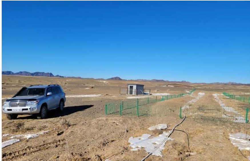
Telmen staff inspecting the exploration camp location during the current site visit

This is the final requirement for the EIA to be awarded and as expected, initial feedback has been very positive. While the delay in getting to site due to COVID restrictions has been frustrating, we appreciate that Telmen is working diligently within the control measures put in place by the Mongolian authorities to protect the health and well-being of its workers as well as the community in which the Company operates. We have continually been encouraged by the positive attitude of the Mongolian authorities and the expediency with which they have gone about the task of moving things forward."