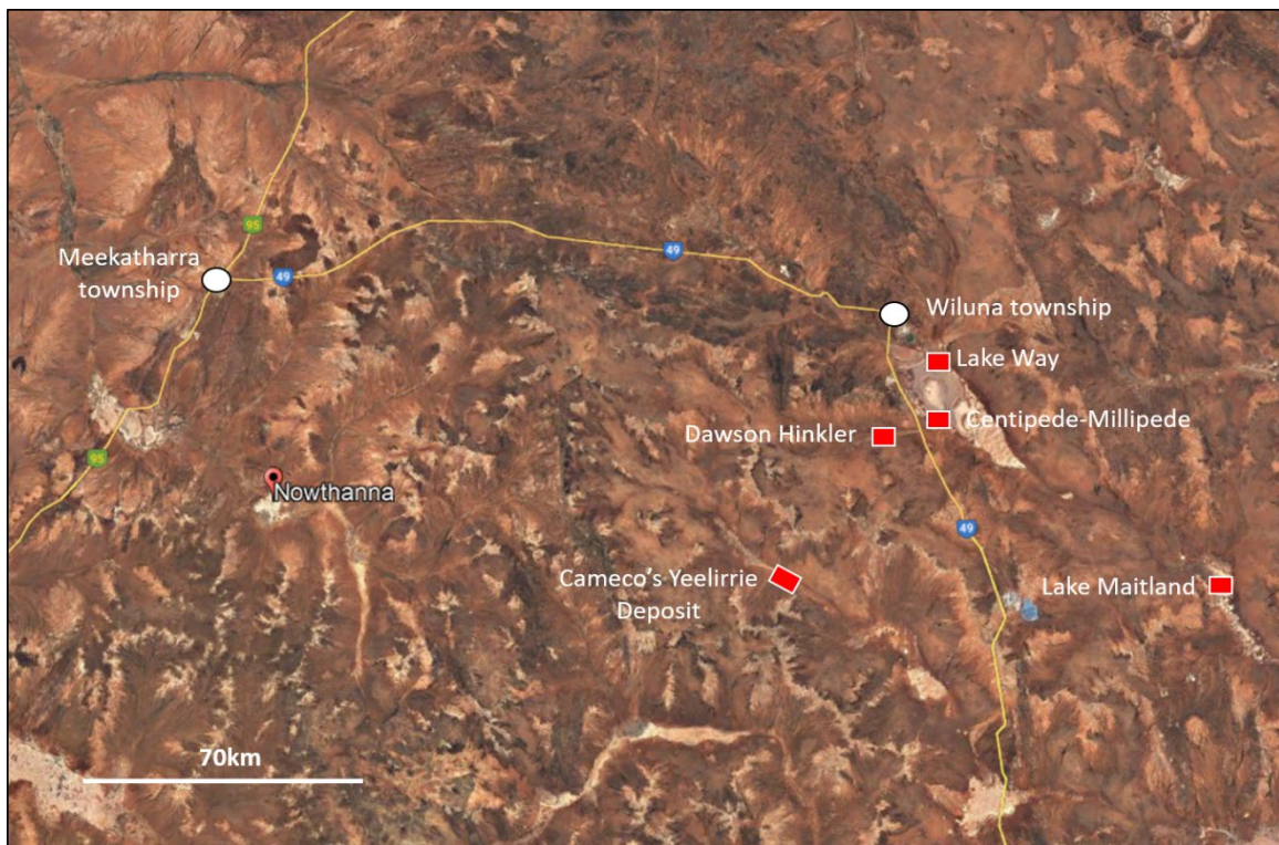
Figure 2: Approximate location of Toro's Nowthanna Deposit relative to the deposits of the Wiluna Uranium Project. Note, the approximate location of Cameco's Yeelirrie Uranium Deposit is also presented. See text for further details. This map has been created by modifying an image from Google ©.

Once again, Nowthanna will also have the potential for a V 2 O 5 by-product being of the same deposit type as those of the Wiluna Uranium Project.