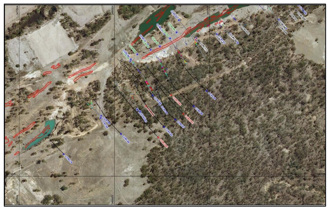
Figure One: Diamond Drilling Location Plan on aerial image

Once all results have been analysed by the laboratory and the results received by the Company, the initial JORC resource for Camel Creek will be completed.