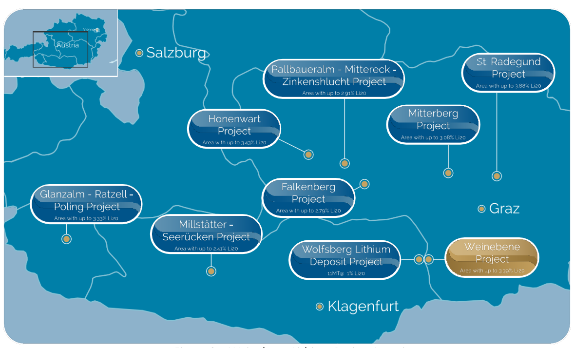
Figure 2 – Weinebene Lithium Project Location

Jadar Resources has entered into a Collaboration Agreement with European Lithium which includes the establishment of Technical Advisory Committee to enhance the projects for the purpose of jointly collaborating in connection with the Weinebene and Eastern Alps Projects and sharing information to identify the best options to advance those assets and operations. This includes making recommendations for exploration programs, budgets and development scenarios in relation to the assets and operations.<sup>3</sup>