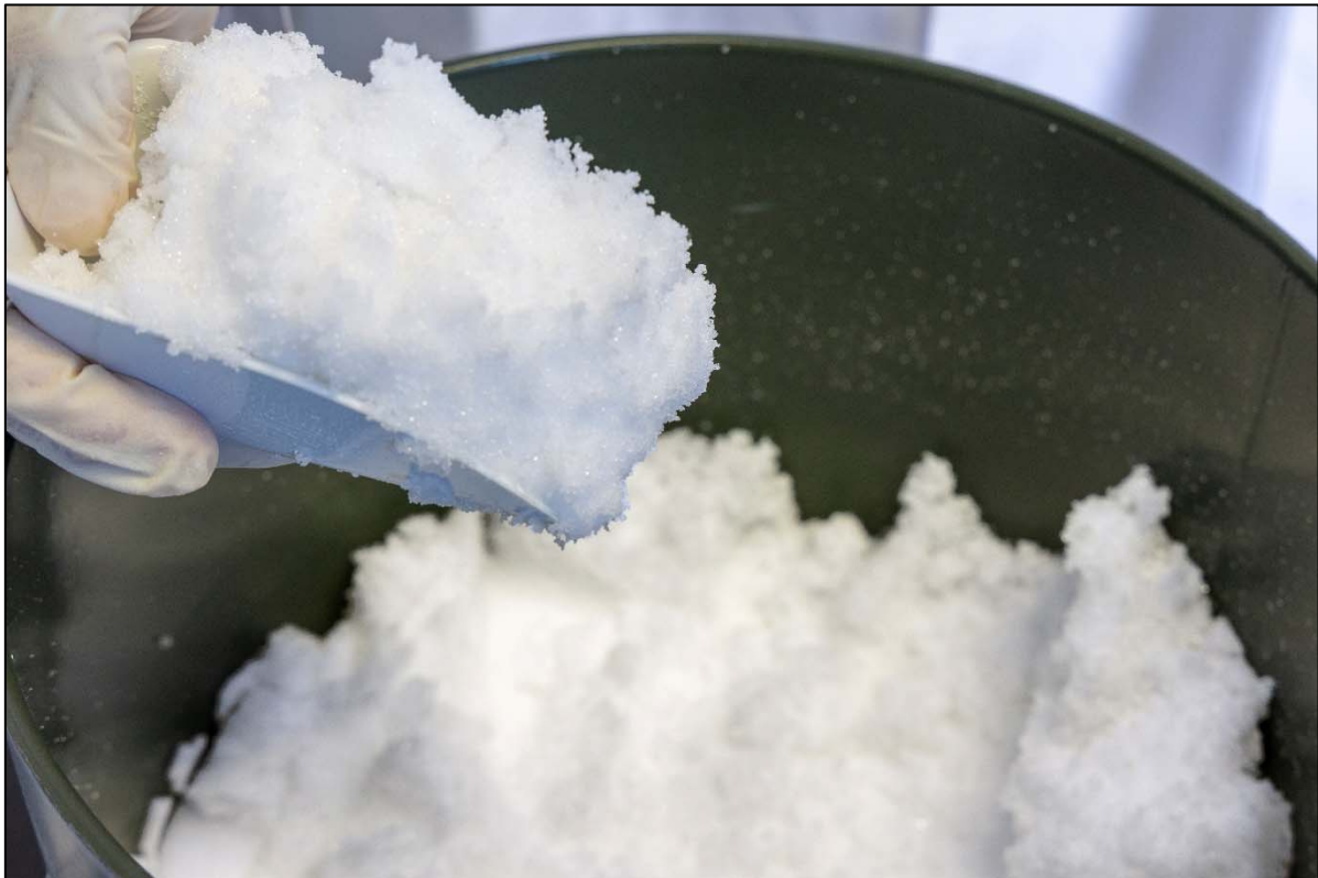
Figure 1: Campaign 1 Type 1 Precursor – Aluminium Salt

King River Resources Limited (ASX:KRR) is pleased to provide this update on the ongoing laboratory work which supports the Definitive Feasibility Study for the Type 1 Precursor Processing Plant. As previously reported (KRR ASX release 3 November 2021) KRR is focussed on the production of a variety of Aluminium Salt 5N (99.999%) purity Precursors required in the battery manufacturing industry and continuing testing with other Cathode Active Materials precursors (P-CAM).