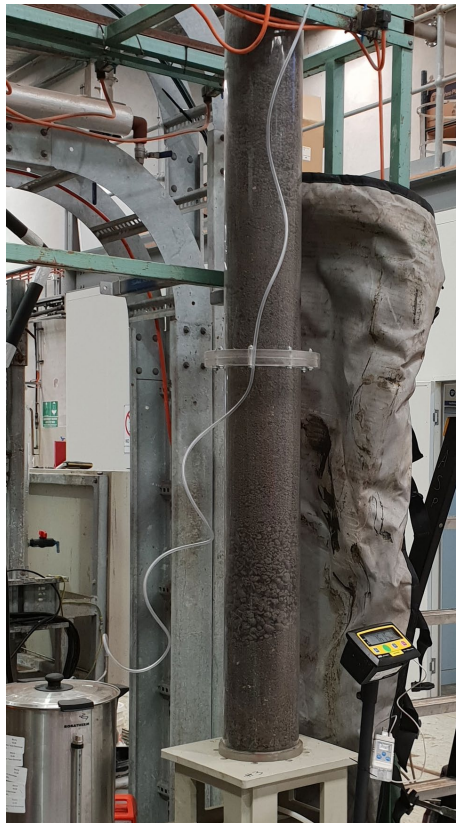
Image 3 / Nifty Metallurgical Column Test Work

A consultant has been engaged to firstly, build a complete mass balance and copper recovery cathode software model for the project based on the metallurgical parameters and then secondly, to design and build a metallurgical accounting system for the project so that it is ready upon the commencement of plating copper metal at Nifty. This work is well advanced.