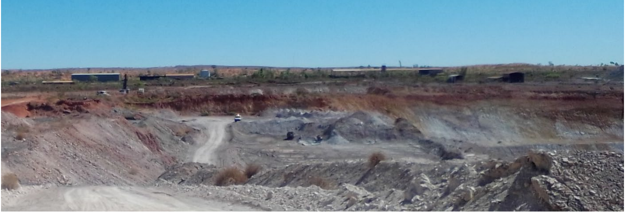
Image 1 / RC Drill Rig on South Eastern end of the Nifty Open Pit

Project as there are further copper tonnes to be added to the project copper inventory but also potentially delays final mine designs and schedule progress.