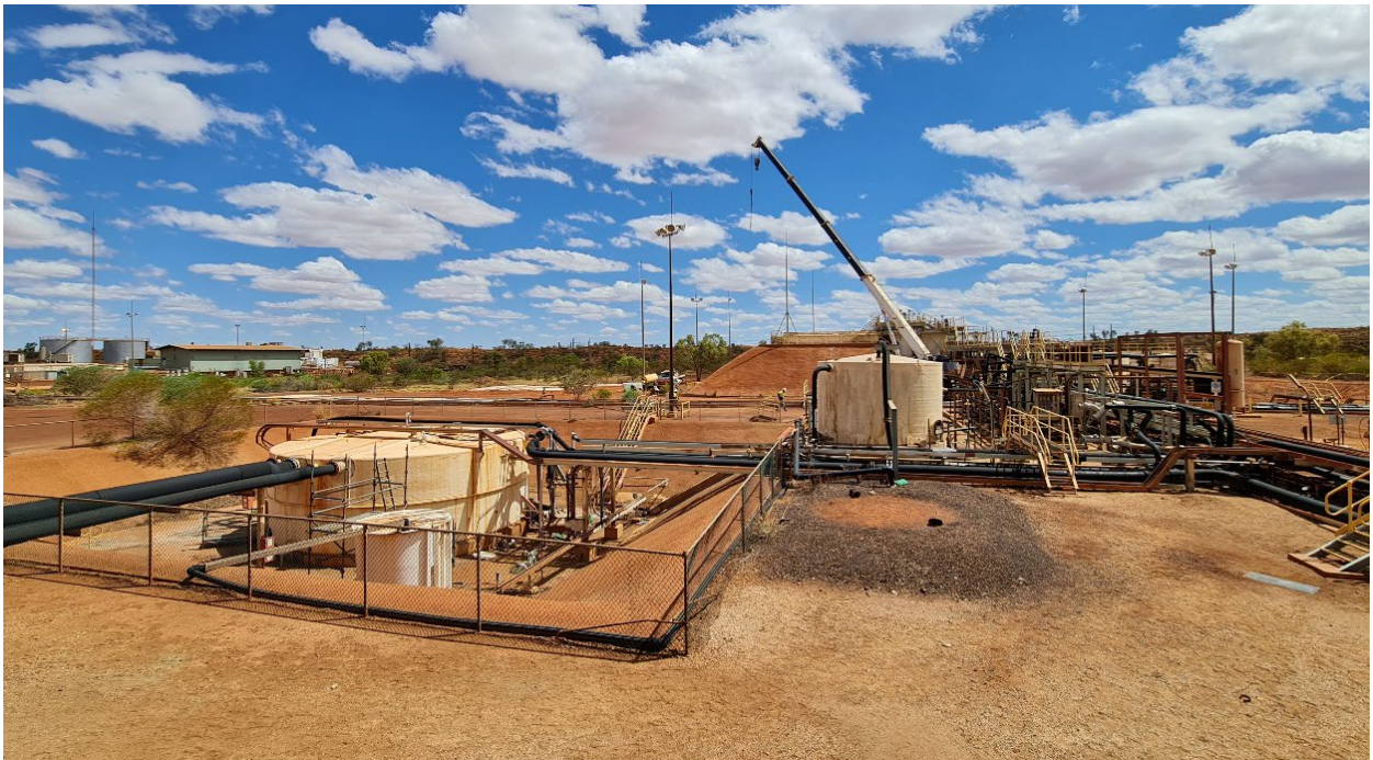
Image 3 / Refurbishment of the Solvent Extraction ("SX") Plant commenced

During CYM's tenure, staff have rectified a number of legacy issues at the site that have been paid little attention for some years and site crews have managed to rectify a number of areas that have previously been raised by the regulators. Further, the site crew have been cleaning and collecting years of rubbish and waste to centralised locations and are now going through a process of scrap, recycle or disposal for these waste streams. These waste streams also include chemicals and reagents that are expired and have been on site for many years. The sale of unwanted or scrap equipment has been commenced with sold items already been removed from site. This process will continue for some time due to the volume of equipment, materials, scrap and rubbish that has built up while Nifty was operational.