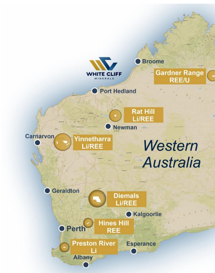
Figure 1: Li/REE Project location map in Western Australia