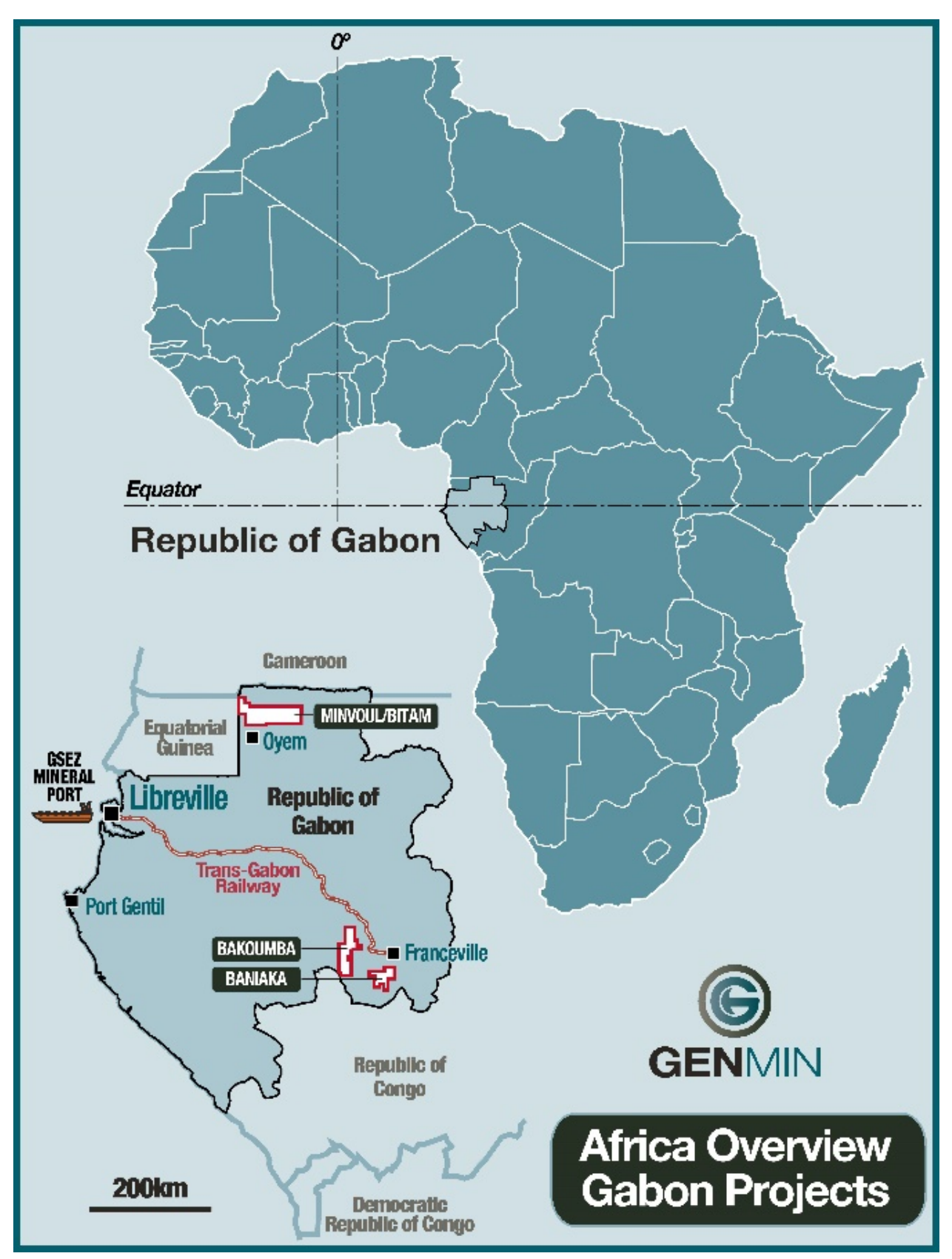
Figure 1: Location map of Genmin's iron ore projects in Gabon, central West Africa