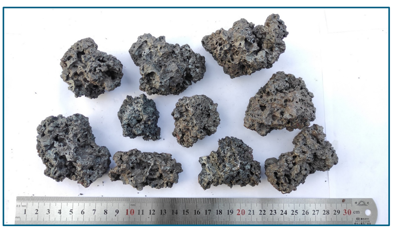
Figure 2: Sinter from pilot sinter pot tests containing 20% Baniaka Fines iron ore