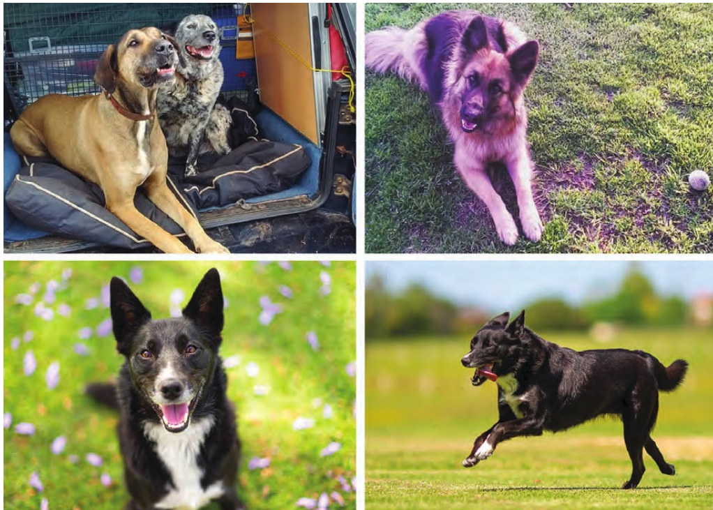
Pet dogs in the MPL tablet Phase 2 trial enjoying time with their owners