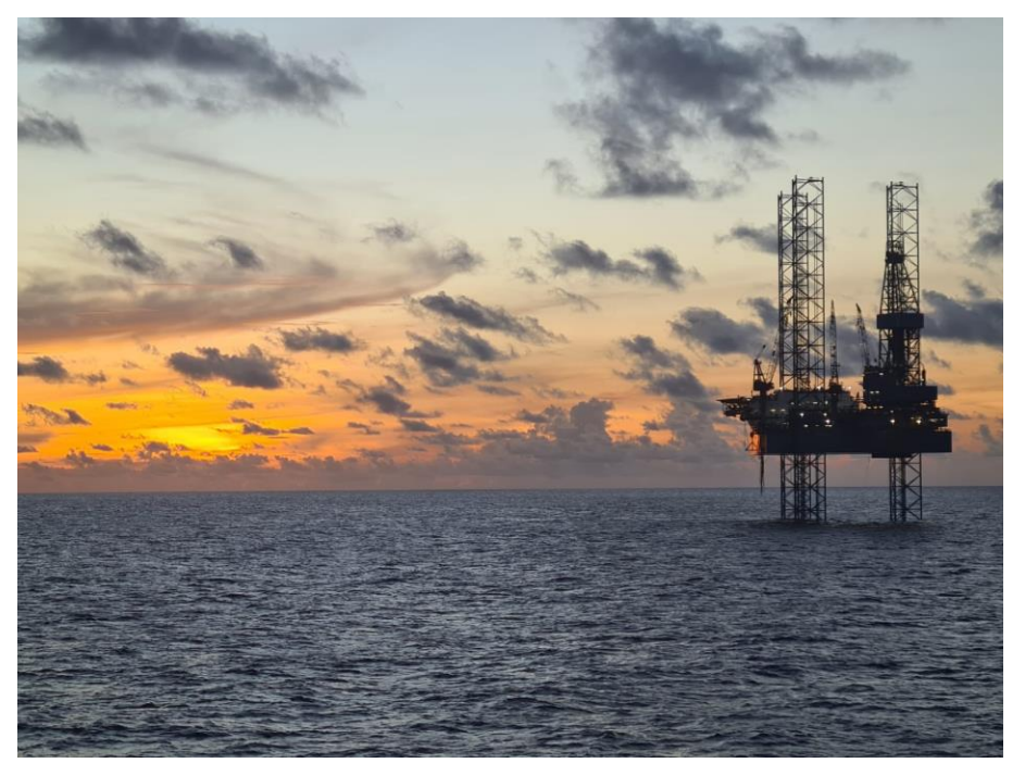
Valaris JU-107 on location at Buffalo-10.

No hydrocarbons are anticipated to be intersected in this drilling section.