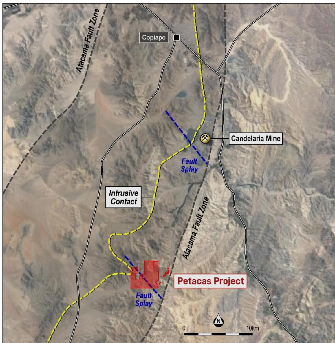
Figure 1: Location of the Las Petacas Project.

This announcement has been authorised by the Board of Directors of Culpeo Minerals Limited.