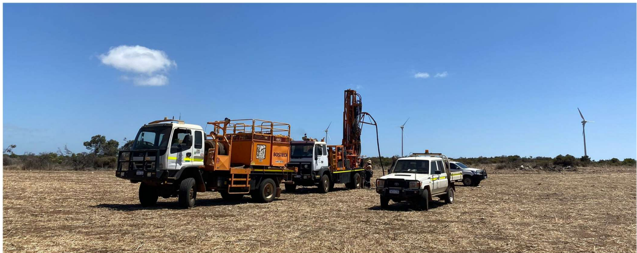
Figure 1: Bostech drilling rig on site

Heavy Minerals Limited (ACN 647 831 833) ("HVY", "Heavy Minerals" or the "Company") is pleased to announce that drilling has recommenced at its 100% owned Port Gregory Project. Specialist Mineral Sands Driller, Bostech Drilling remobilised to site on the 7 th January to begin the 2022 campaign. The 2021 program saw a total of 100 holes drilled for 3,094 m. Assay results for the entire 2021 program will be available for release to the market in late January, subject to laboratory throughput and HVY's interpretation and compilation.