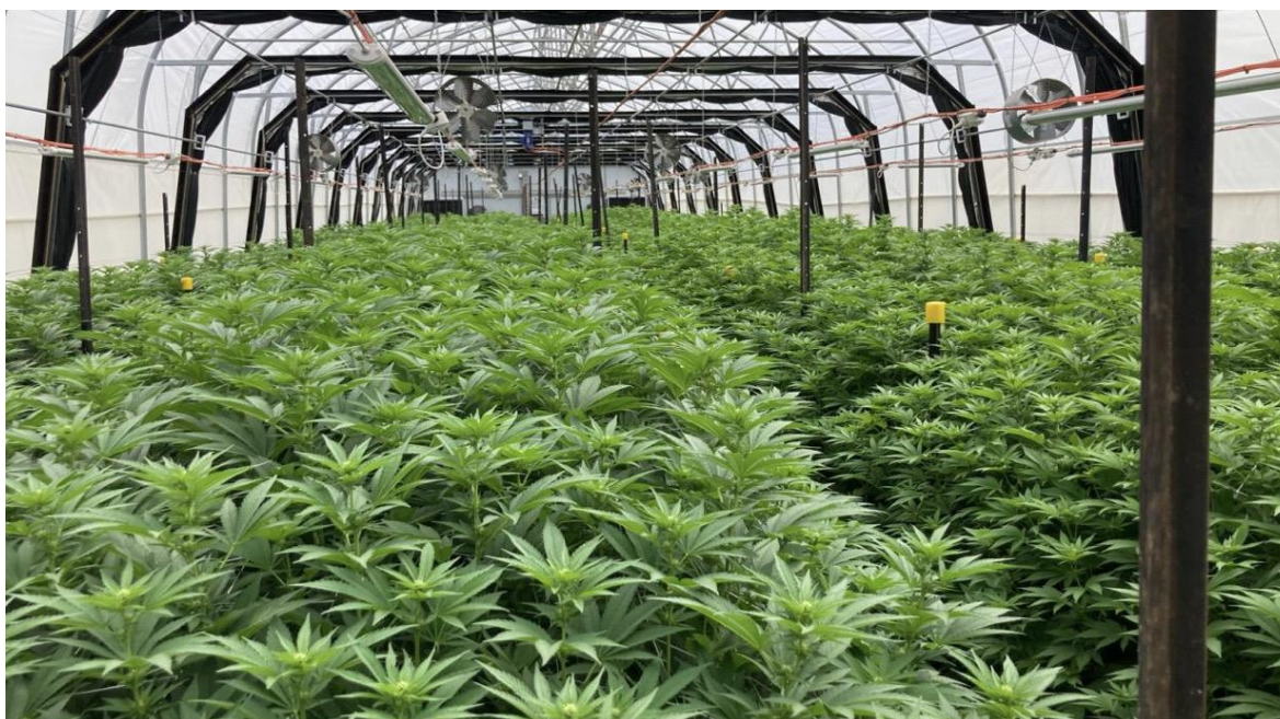
Image: ECS' newly erected protected cropping enclosures to be harvested this month –follows planting in November 2021

With competitive pricing and demonstrated quality, ECS continues to experience increasing demand for dry flower and oils for both the domestic and international markets, with preparations for first exports of both dry flower and oils underway. The Company will continue to update shareholders on growth initiatives over the coming months.