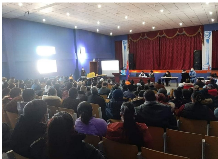
Community meeting in Gurvantes Soum(district)

Drilling remains on track to commence in the current Quarter, with the drilling program to include the completion of 4 fully tested core holes which will be used to assess the Coal Seam Gas potential of the Coal resources in the Nariin Sukhait area of the South Gobi Basin. Preparations for the drilling program are well advanced and on schedule.