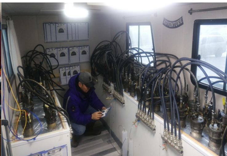
Gas desorption laboratory under construction in preparation for the drilling program