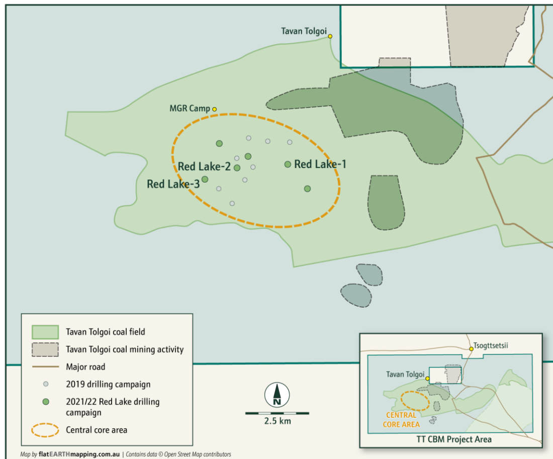
Figure 2 - Permit area showing locations of Red Lake-1, Red Lake-2 and Red Lake-3