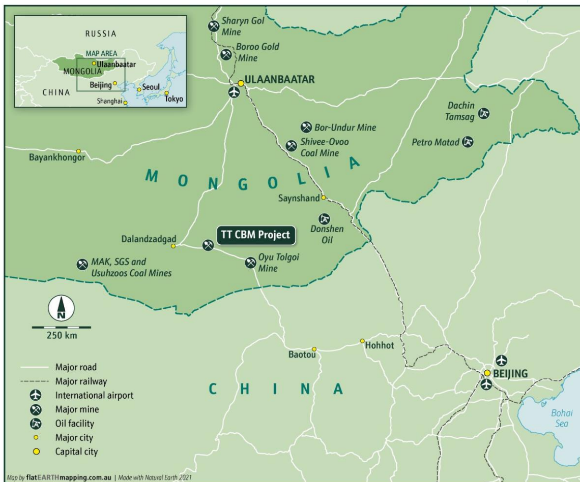
Location of the TTCBM Gas Project in the South Gobi Basin in Mongolia