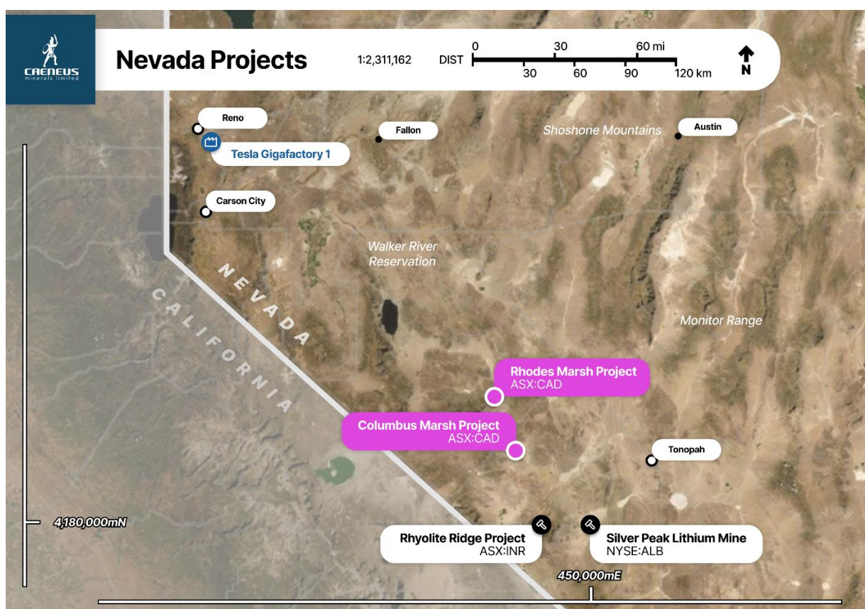
Figure 1. Location Plan Caeneus Lithium Projects

During the preceding 12 months, the Company has been conducting historical technical data reviews as well as evaluating its further corporate options for the two 100% owned lithium brine projects, Columbus Marsh and Rhodes Marsh, which it holds within the lithium-producing Clayton Valley region in Nevada, USA (figure 1).