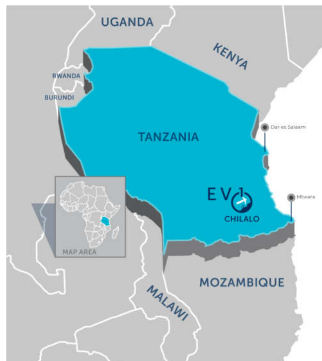
Chilalo Mineral Resource Estimate 2

The Chilalo Project hosts a high-grade mineral resource of 20.1Mt at 9.9% total graphitic carbon (TGC) for 1,991 Kt of contained graphite, as shown in the table below.