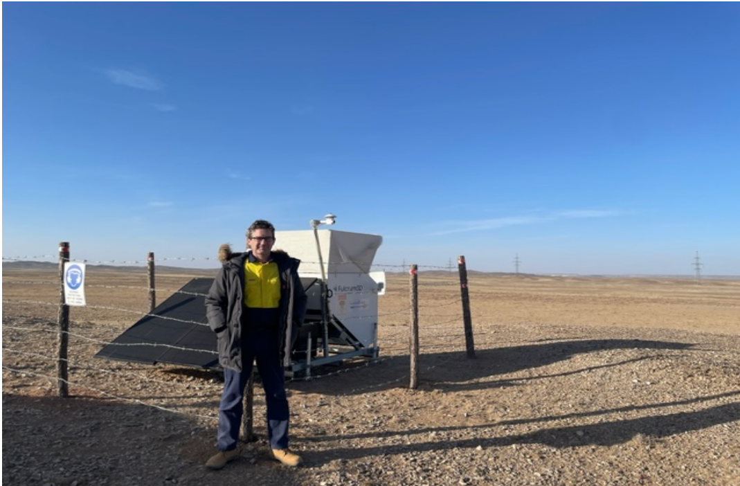
Elixir's SODAR deployed in the Gobi close to the main transmission line from China