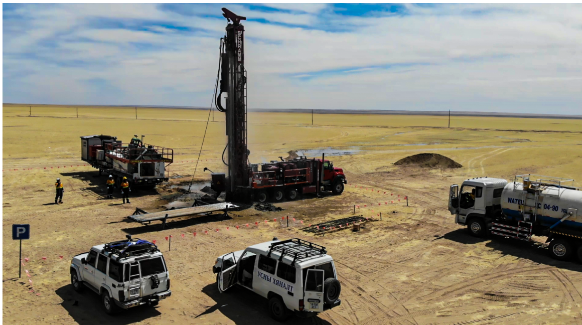
ErdeneDrilling's water drilling operations in the Gobi region

Elixir and Erdene have recently formalized their relationship over procuring water for hydrogen through an Agreement for the provision of water advisory services. The parties are currently planning field based water exploration and appraisal activities for later in the year.