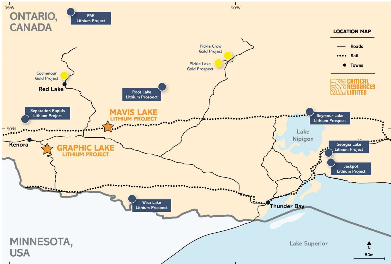
Figure 3: Graphic Lake project location

The Project is situated in the Sioux Lookout Domain of the Wabigoon Terrane in north-west Ontario. The claims comprise a pegmatite swarm trending NE/SW with a width of 300m and estimated strike of 5.5km. These pegmatites are observed to follow the foliation of the Royal Island group metasedimentary host rocks.