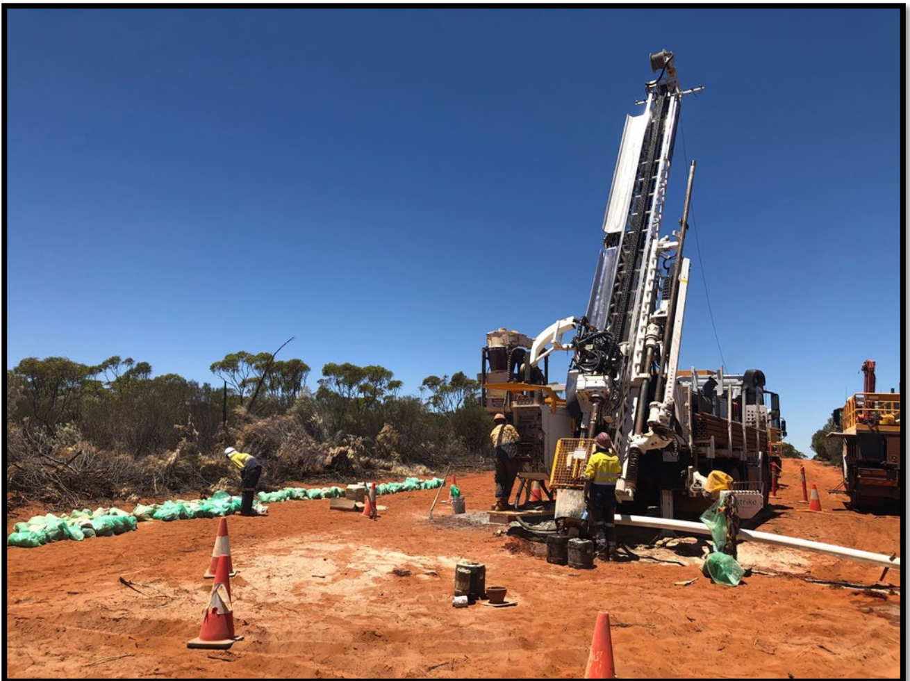
Figure 1: Drilling at hole APSRC0027 at Penny South on the 21/01/2022

Aurum Resources is pleased to announce that the Penny South drilling programme has commenced targeting the structural targets identified in two main areas based on similar setting to Penny West and Penny North (Ramelius ASX:RMS) gold mine which lie just to the North. A total of 18 holes are planned based on the structural interpretation and are in addition to an earlier work program, which was primarily based on exploring the existing down hole geology and analytical results. Over 5000m of RC drilling is planned, focused on the most promising areas of the licence. Strike Drilling have been contracted for the programme.