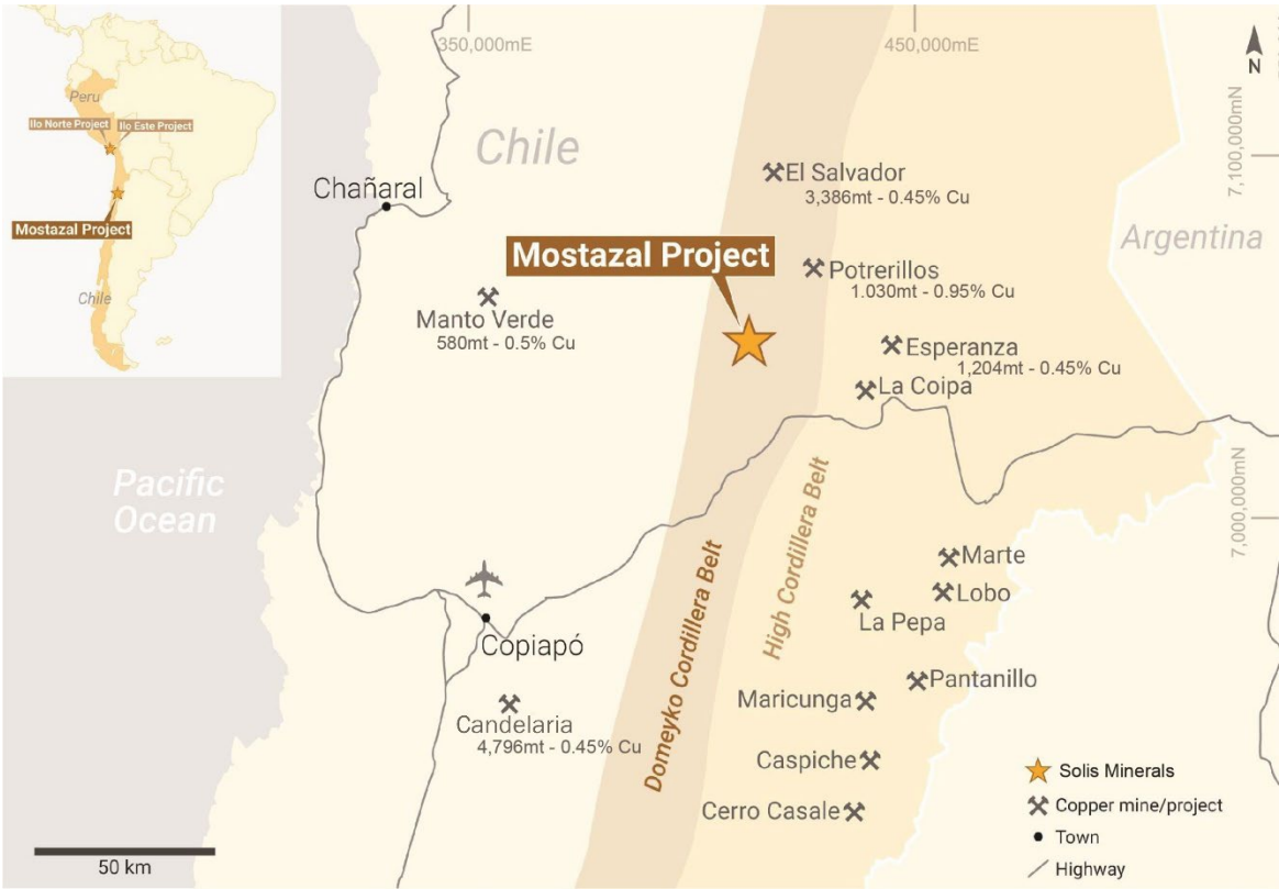
Figure 3: Mostazal Copper Project location.