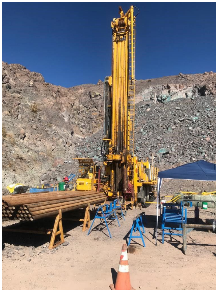
Figure 1: Mostazal Copper Project –diamond drill rig on site - MODD001

Field crews and drilling equipment mobilised earlier last week to set up on the program's first hole (Figure 1), which will target a series of near-surface manto-style copper mineralisation “lenses” defined by historic diamond drilling (Figure 2, Target Area 2).