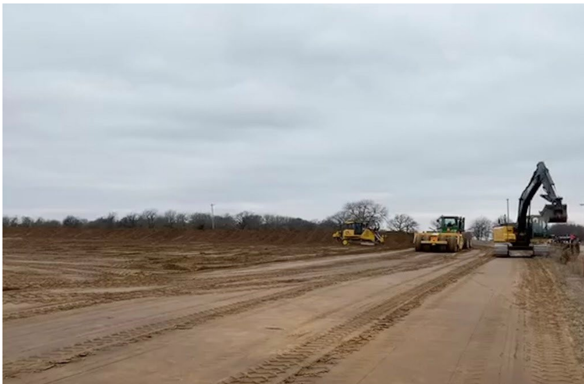
Figure 2. Earth moving equipment on site constructing the Flames Well pad

The Flames Well pad has been designed as a multi-well pad to accommodate both drilling and the large assembly of completion and stimulation equipment that will be required post drilling. In addition, the design of the pad will allow for drilling of multiple wells in anticipation of future full field development of the Flames Unit.