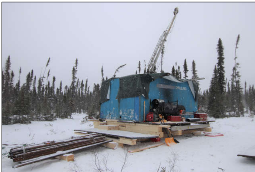
Figure 1 – Drilling at the Esker Gold Prospect, part of the Western Hub at the Pickle Lake Gold Project

The diamond rig, which is operated by First Nation owned and operated Missinaibi Drilling Services , has commenced a 4,000m campaign targeting the Company's Esker gold prospect.