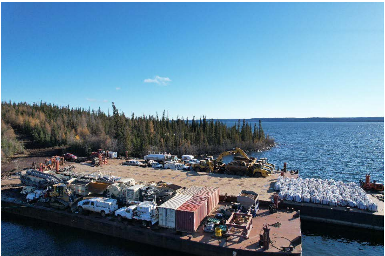
Figure 2 – Mining Fleet Demobilisation and Concentrate Loading

Mining operations at Nechalacho ceased in October and equipment demobilised from site.