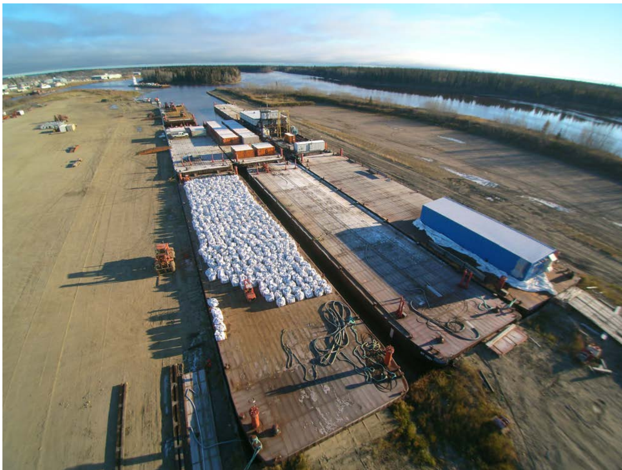
Figure 3 – Beneficiated Ore on MTS Barge at Hay River Commencing Unloading

Vital produced more than 1,000 bags of beneficiated product at site, each totalling approximately 1,000kg of material. The first of these bags have arrived in Saskatoon to be processed at Vital's rare earths extraction plant, which is under construction. The transportation of this product has provided the first opportunity to test the logistics of transporting beneficiated product from site to the Saskatoon facility.