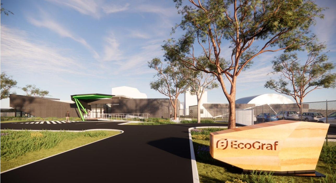
View of EcoGraf HFfree™ BAM Facility entrance from Alumina road (looking west)

In addition to adopting a zero-waste operating strategy that includes maximising the recycling and re-purposing of production inputs, eliminating all gaseous emissions and value-adding by-products, the new facility also adopts a low impact visual design that complements its immediate surrounds and advanced manufacturing purpose