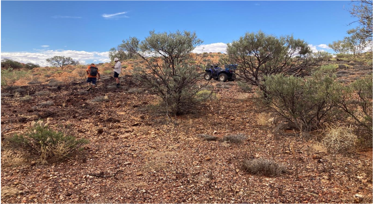
Figure 4: Gossanous dolomite horizon on ELA E08/3332.

A number of stream sediment samples were taken at ELA E08/3330 to assist with early targeting and for baseline geological data for further stream sediment sampling campaigns. It was also observed that large portions of ELA's E08/3329, E08/3330 and E08/3332 would be amenable to stream sediment sampling.