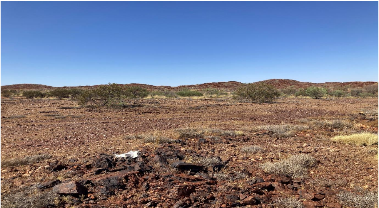
Figure 3. Iron and Manganese brecciated quartz looking west to foliated mafic schist hills on ELAE08/3330.

On ELA E08/3330 and outcrop east of the regional scale Cheela Fault was identified and contained foliated mafic volcanics in the northern portion (Figure 3) trending into massive chert then dolomite moving south east and out of the tenure. A number of rock chip samples were taken (see table 1) including brecciated quartz veins, brecciated chert and gossanous dolomite, fitting well with the early potential ore genesis model.