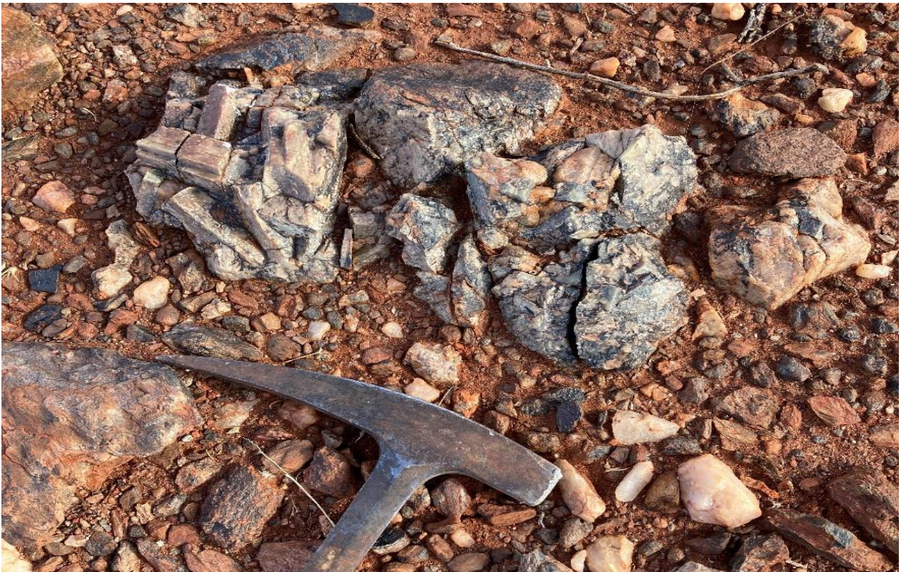
Figure 5: Outcropping quartz albite muscovite pegmatite at ASR004.

A number of stream sediment samples were taken at ELA E08/3330 to assist with early targeting and for baseline geological data for further stream sediment sampling campaigns. It was also observed that large portions of ELA's E08/3329, E08/3330 and E08/3332 would be amenable to stream sediment sampling.