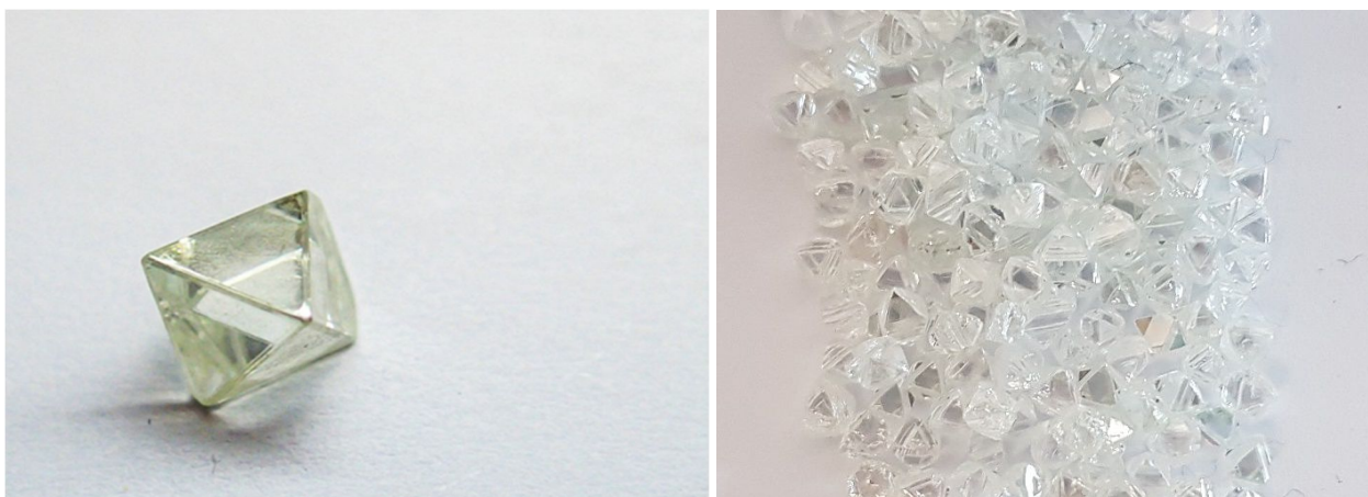
Top left: 5 grainer gemstone. Top right: 2 grainer gemstones