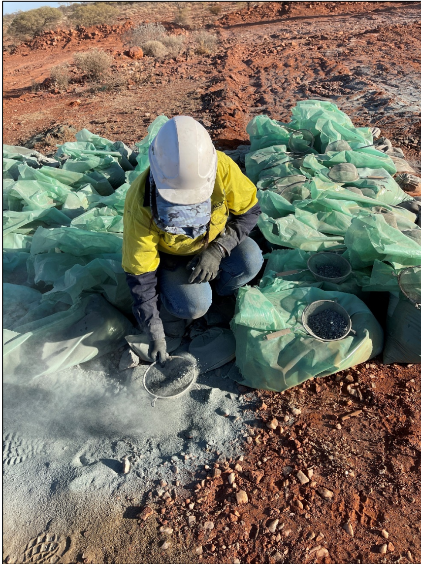
Figure 4. Field technician sieving drill chips at the Niobe drill program.