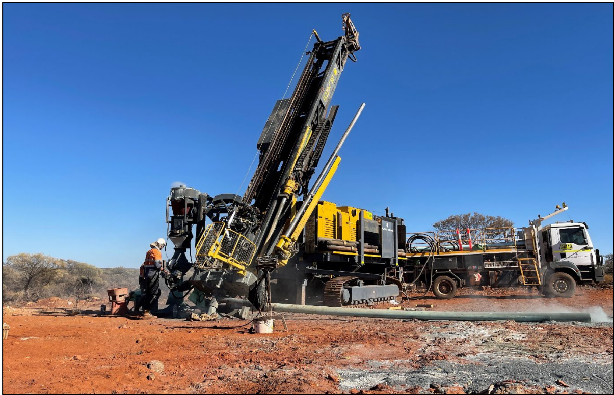
Figure 1. RC rig in action at Niobe

Aldoro Resources Limited ( Aldoro, The Company ) (ASX: ARN) is pleased to provide an exploration update for the Mineral Resource drilling program at the Niobe Project. A further fifteen holes have been completed, with all intersecting pegmatites. The full results of these holes will be announced when geological logs, systematic pXRF readings, and QAQC checks are completed.