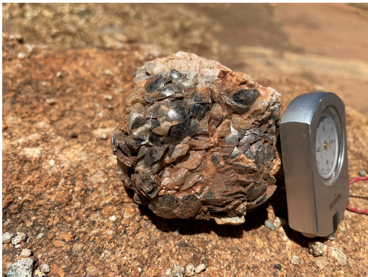
Figure 3. Photograph of pegmatite specimen located near the drill grid at Niobe, showing abundant mica content.