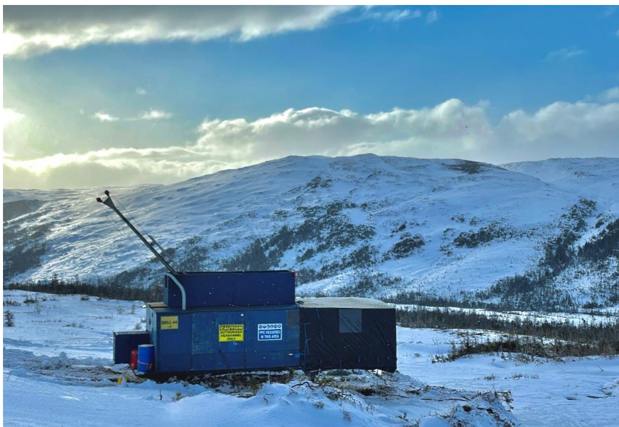
Figure 1 Inaugural winter diamond drilling at PW East with Window Glass Hill in the background