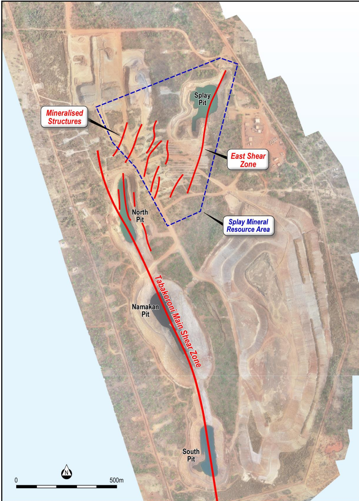
Figure 3: Tabakoroni drone photograph showing main structures and resource areas