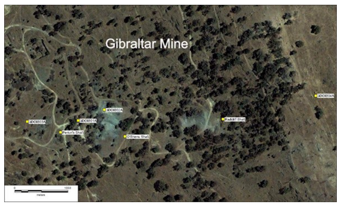
Figure 2: Location of the Planned drilling Program at Gibraltar mine area

A further program of approximately 500m of drilling is also planned for the Gibraltar area. This mine is one of the largest historical gold producers in the area with around 140,000oz of gold having been produced to date. Gibraltar has had only limited drilling historically that suggest a multiple vein system is present and possibly some unworked parallel veins. The main workings recorded at least 5 veins and also the possibility of larger low grade bodies in and around the Perkin's Shaft workings. The proposed drill program is primarily designed to test some of these targets where access is readily available. Further parallel veins exist to the south of the mined area which provide further exploration opportunity, which the company expects to advance in the future.