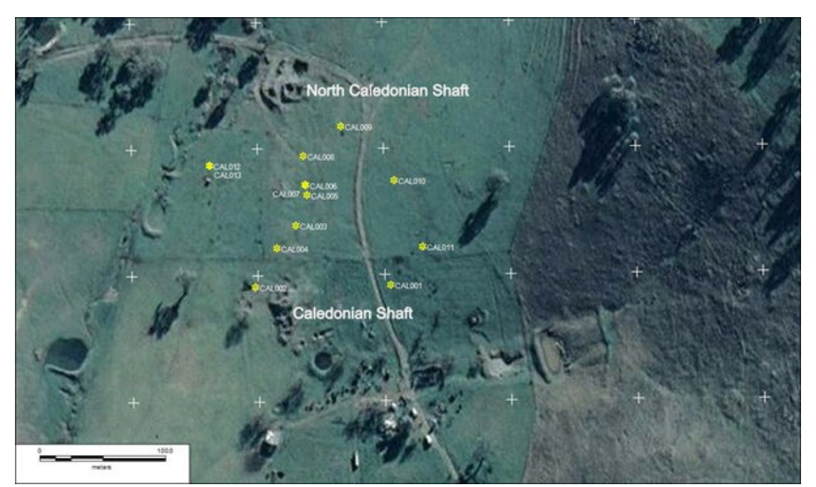
Figure 1: Position for an initial 13 drill holes which vary depending on drill results