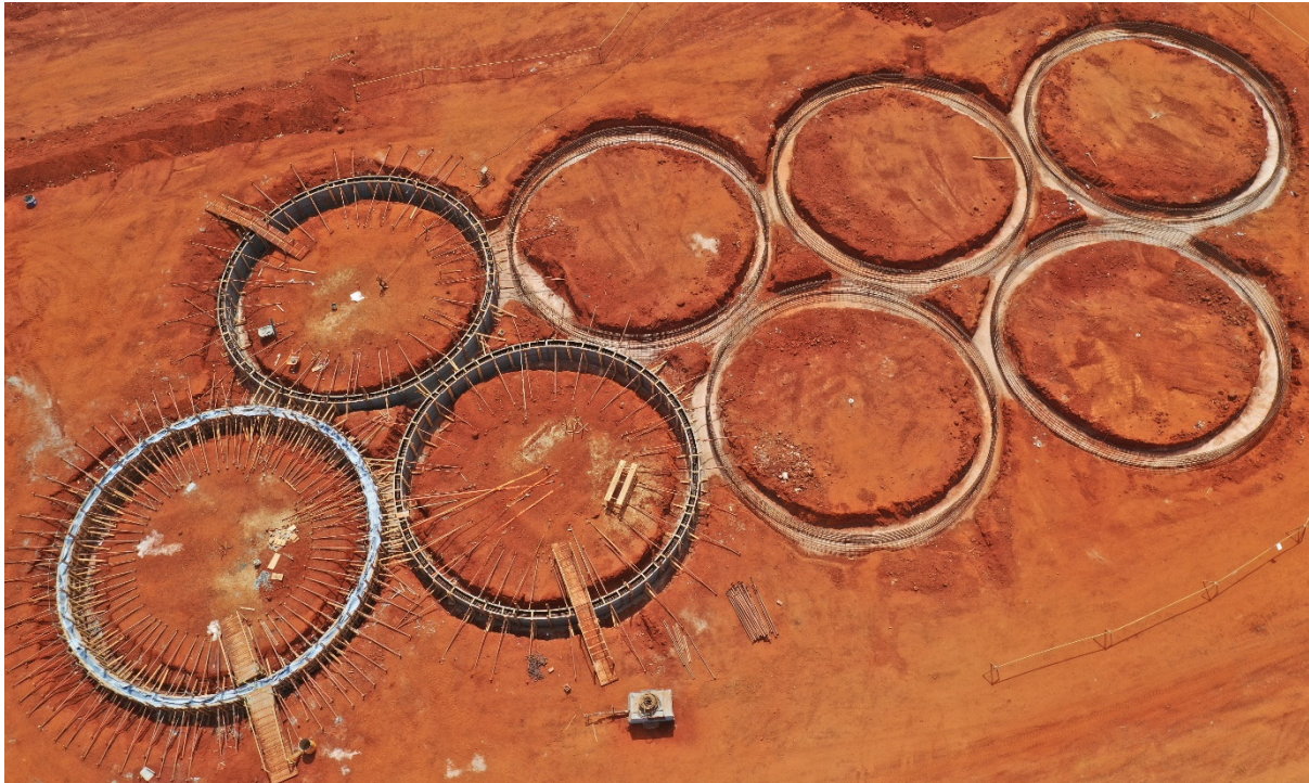
Figure 1: CIL ring beams

Construction is tracking well against schedule with progress achieved on the administration office, cafeteria building, and the first 120 camp rooms. The civil concrete contractor has poured concrete for the CIL ring beams. Figure 1 to Figure 5 show the progress achieved on site during January 2022.