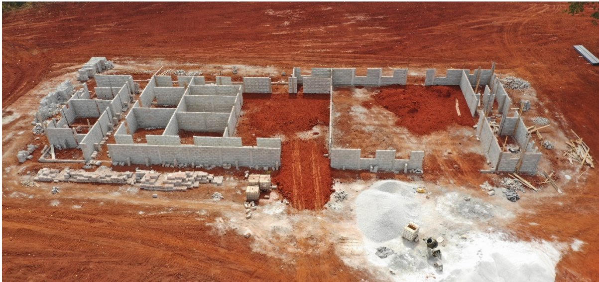
Figure 5: Administration office construction