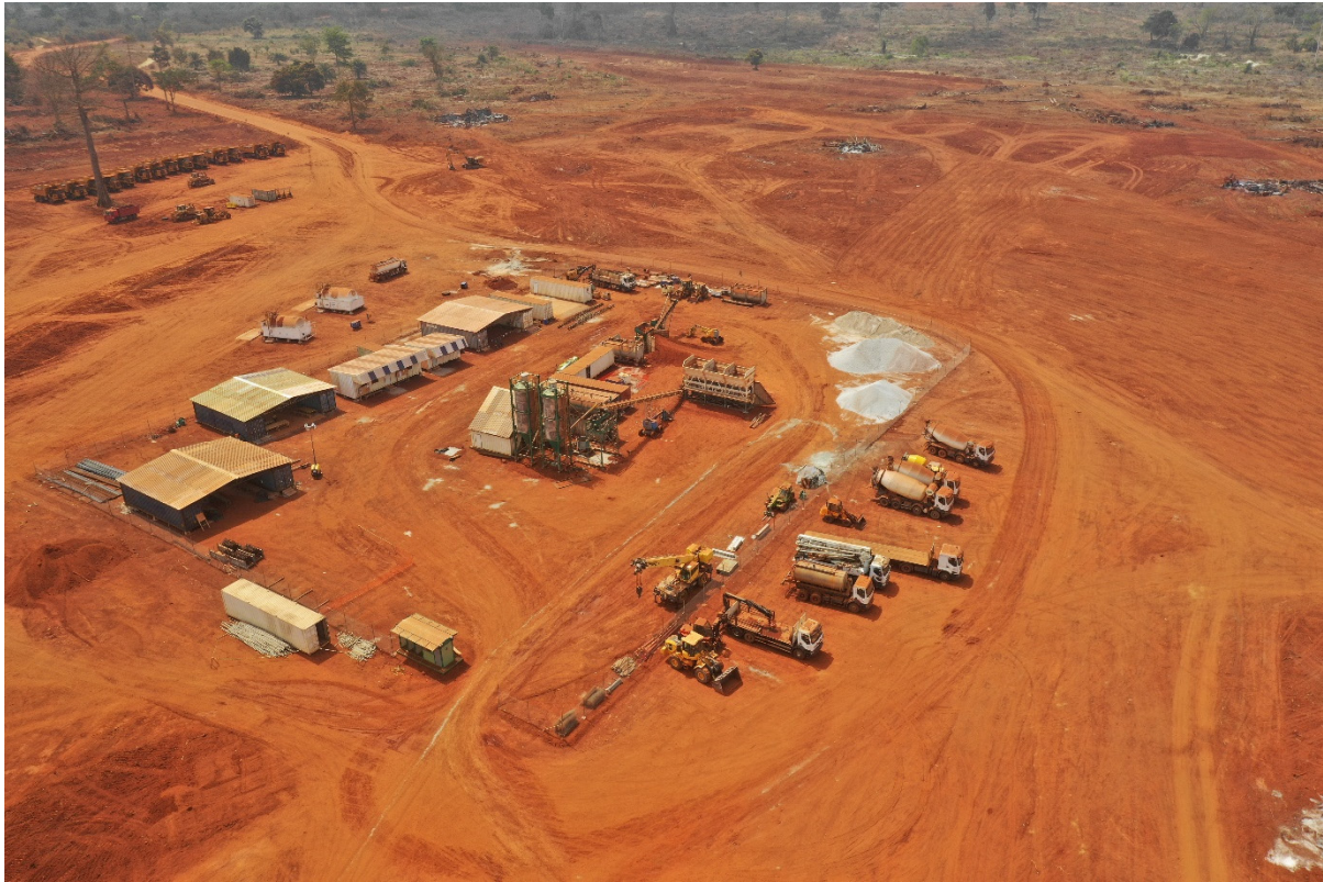
Figure 3: Civil contractor area at Abujar