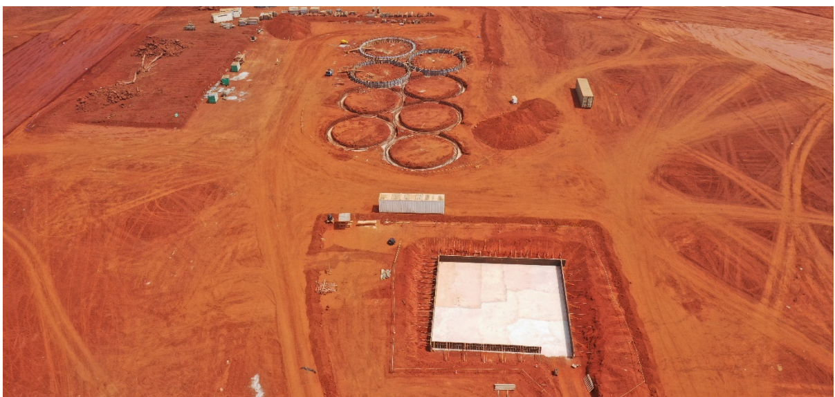
Figure 2: Aerial view showing Abujar plant site earthworks