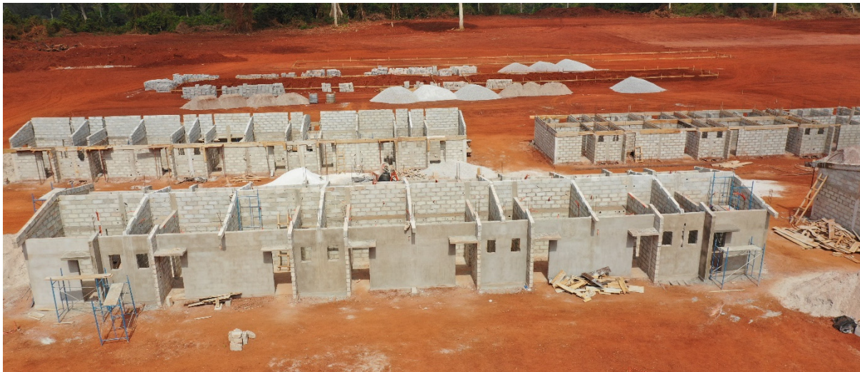
Figure 4: Camp accommodation units under construction