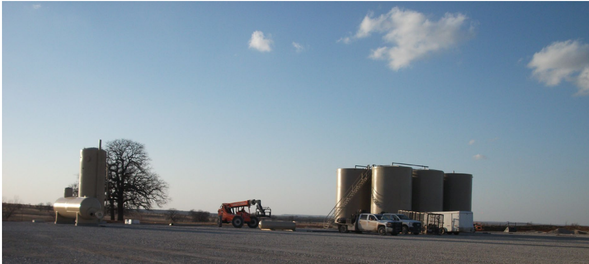
Figure 2. Rangers tank battery and separators