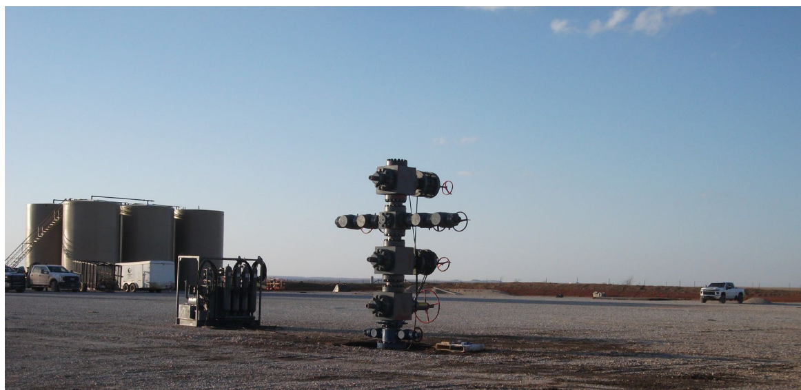
Figure 1. Rangers well Christmas tree with tank battery in the background

Complete installation and plumbing-in of surface production facilities in preparation for completion operations and production. Move in and rig up completion equipment and commence completion operations.