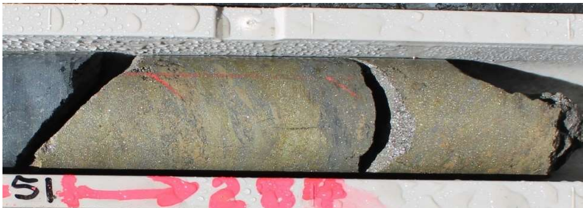
Figure 1 CRR21DD_08 0.3m interval of massive sulphide from 51 – 51.3m , mainly chalcopyrite (copper-iron sulphide) and sphalerite (zinc sulphide), assaying 6.25% Cu, 15.7% Zn, 0.08%Pb, 26.2g/t Ag, 0.59g/t Au. (NQ core, 50mm diameter).

Assays remain pending for Hole 04A from 99.7m to 201.6m (end of hole).