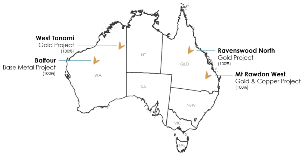
Figure 2. Location of Killi Resources Limited gold and copper projects in Australia.

Killi is a gold and copper explorer with four wholly owned assets in Australia, with a focus on the Tanami region of Western Australia, Figure 2 . The Company is focussed on underexplored provinces with the potential for a large-scale new discovery.