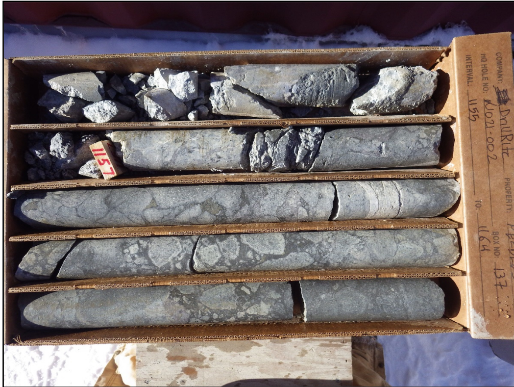
Figure 3. Brecciated unit in hole 21ND_002 showing altered andesite clasts within a pyrite-rich matrix (from 1155 to 1164ft (352 to 354.8m))