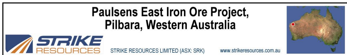
Figure 1: Paulsens East Project Location, West Pilbara