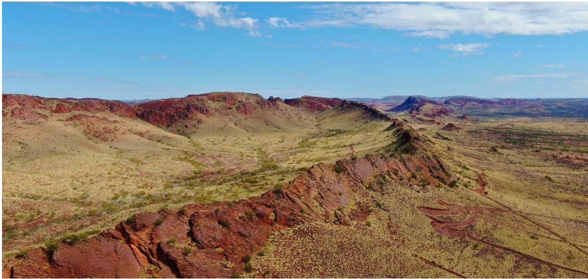
Figure 2: Paulsens East Hematite Ridge

As part of the completion of the February 2022 Updated Feasibility Study 1 an additional JORC Indicated Mineral Resource of 113,000 tonnes at 60.8% Fe, 6.9%, SiO 2 , 3.4% Al 2 O 3 , and 0.10% P (at a cut-off grade of 58% Fe) has been delineated from the high-grade hematite rich detrital material 5 at surface north of the hematite ridge (refer Figure 3).