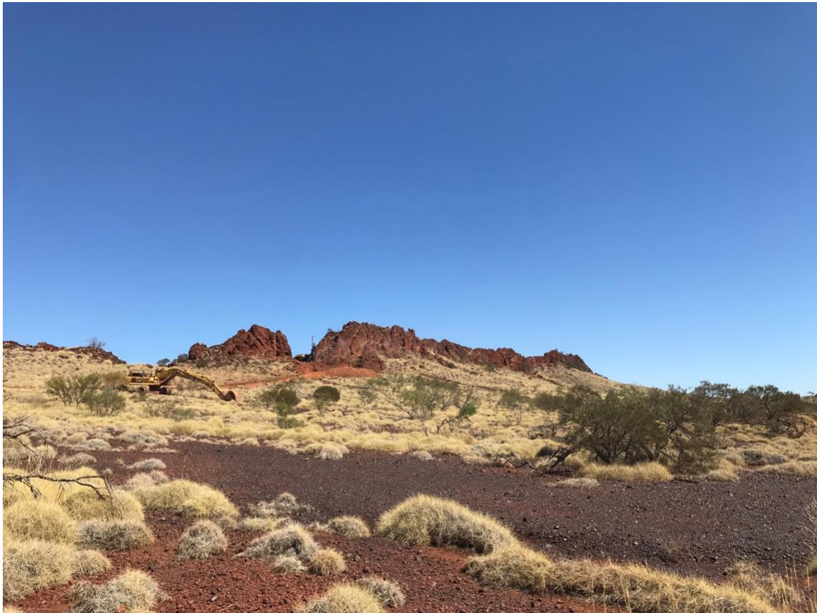
Figure 3 - Paulsens East test pit at eastern end of outcropping hematite ridge with detritals in foreground

Up to 400,000 tonnes of ore will be crushed and screened from these areas to produce DSO Lump and Fines products, with an estimated average Lump product grade of ~62% Fe and Fines product grade of ~59% Fe. Metallurgical test work indicates that a 75/25 (or higher) Lump/Fines split can be expected. Lump ore typically attracts a price premium compared to Fines.